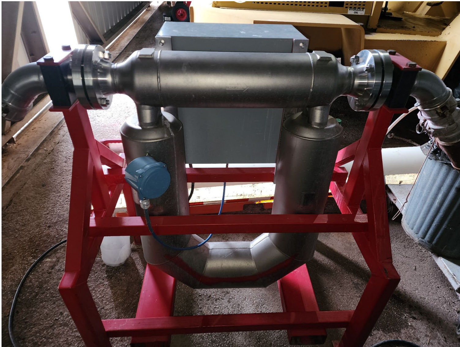
MicroMotion meter setup full assembly